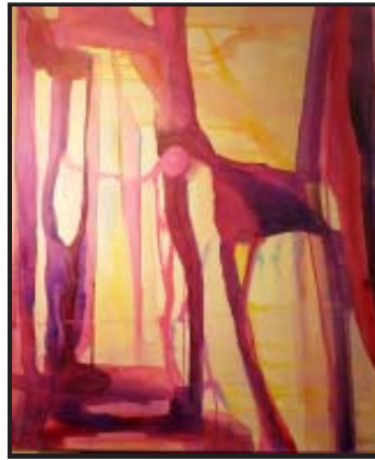
Pink and Mauve Abstract

turn Rt on Charles St., then Rt to 309 Evenson Ave. at the cul-de-sac Ph. 306-946-3676. ggs-gallery@gmail.com To see select examples of murals, click on Wall Murals at www.theUrbanWall.ca Search 'Into It Art' on Facebook.