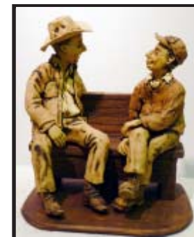
Shooting The Breeze