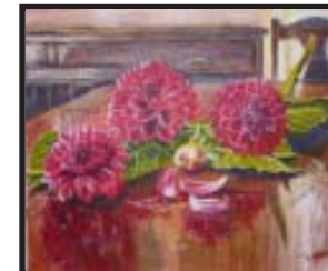
Reflections of Dahlias

a painter who works in acrylics and pastel mediums. She paints landscapes, florals and some portraits. View her work at her home located at 304 3rd Ave. W Watrous Res. 306-946-3885 aaambrose@sasktel.net