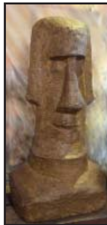
Moai -Easter Island Man