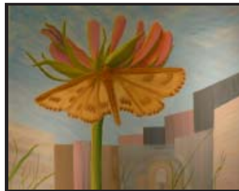
Nature in the City

is a new participant in the Trail. Her paintings in acrylic and watercolour are expressions of imagination, a world of abstracts on canvas. Her works will be exhibited at the Renown Room, Manitou Springs Hotel, Manitou Beach lonifern@sasktel.net Res. 306-946-3465